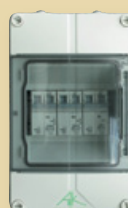
DC circuit breaker