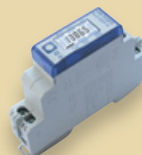
StecaGrid ALD1 Digital energy meter